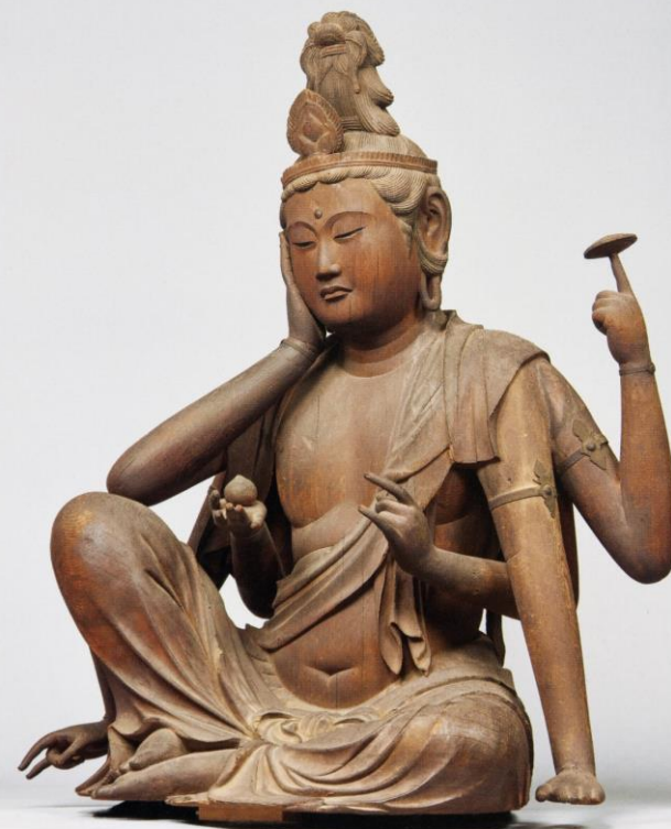
Nyoirin Kannon 如意輪観音 Wish-fulfilling Kannon Celestial Beings