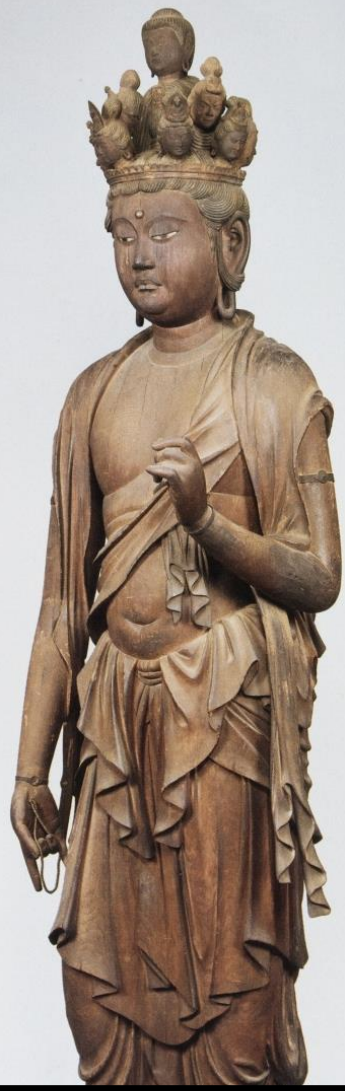
Jūichimen Kannon 十一面観音 Eleven-headed Kannon Ashuras