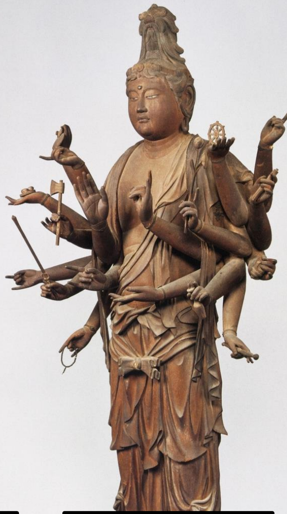
Juntei Kannon 准胝観音 Pure Kannon Humans