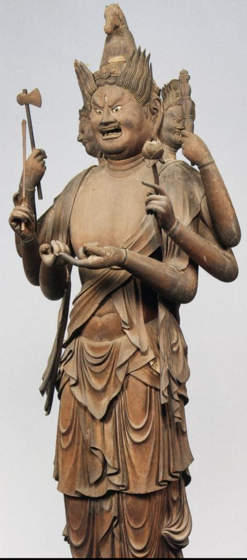
Batō kannon 馬頭観音 Horse-headed Kannon Animals