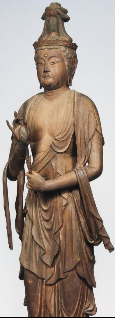
Shō kannon 聖観音 Sacred Kannon Hellish Beings