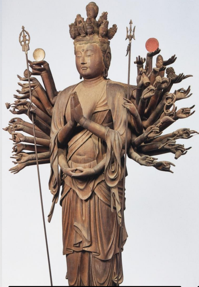
Senju kannon 千手観音 Thousand-armed Kannon Hungry Ghosts